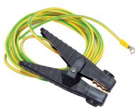
1 earth clamp