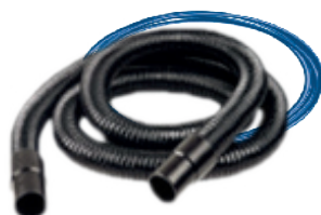
1 hose 5 m | \varnothing 29 mm