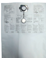
1 dust bag (PN. 058880 - 5 bags)