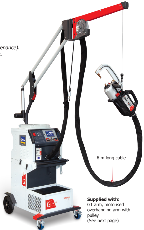
6 m long cable Supplied with: G1 arm, motorised overhanging arm with pulley (See next page)